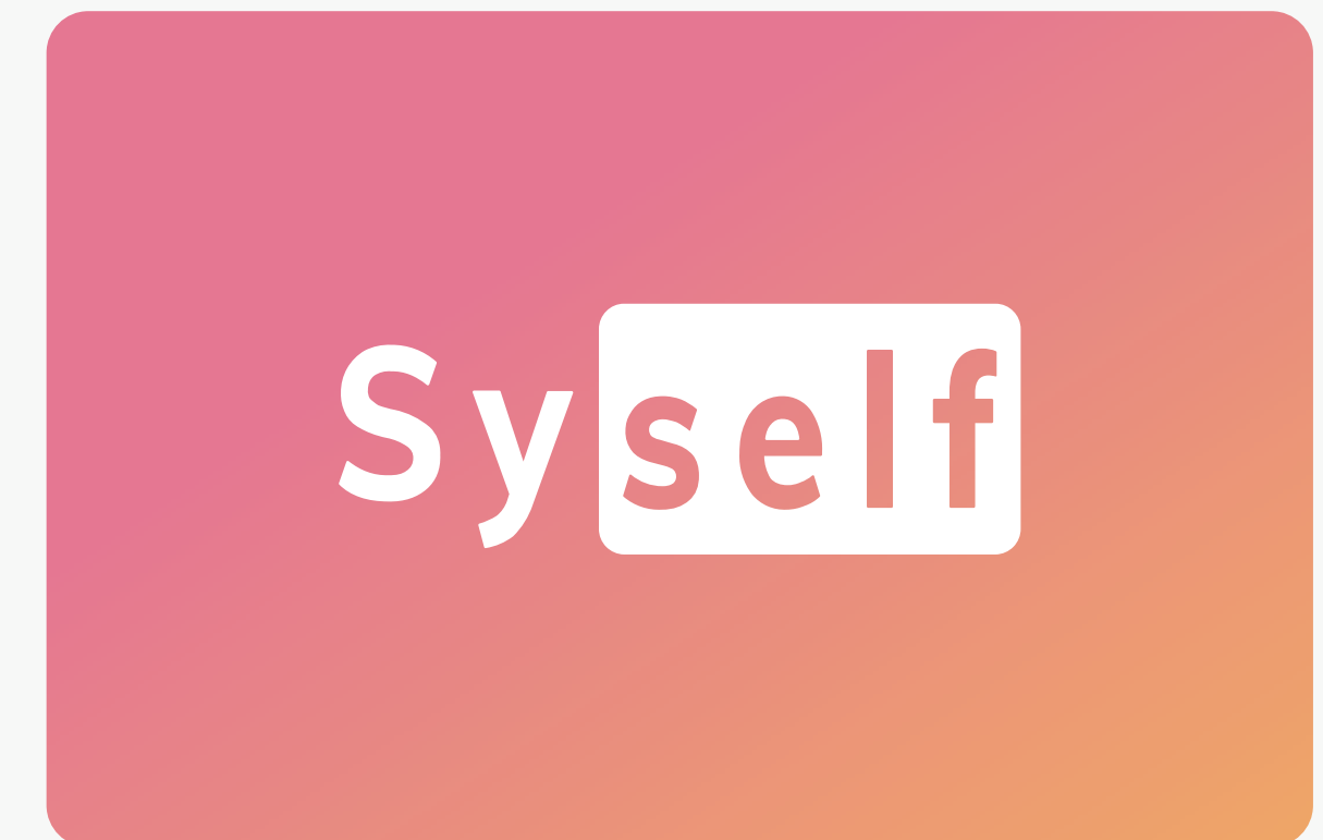
Logo on Syself gradient Background