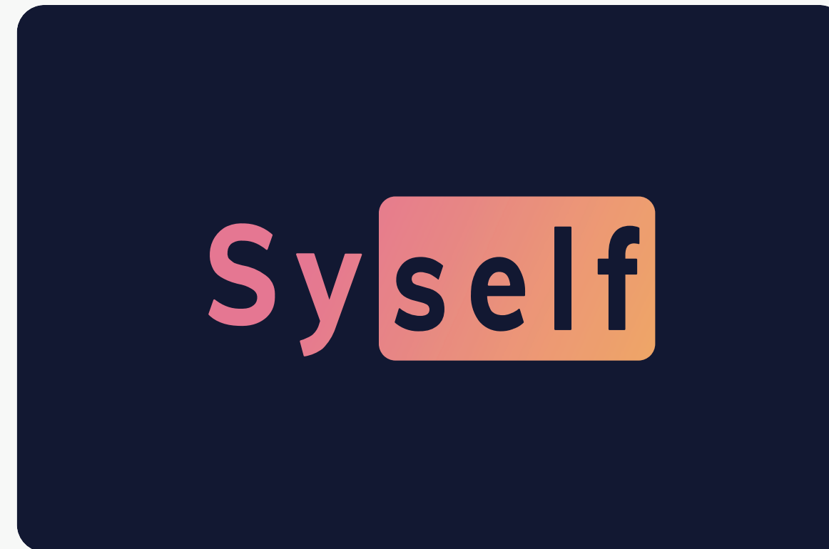
Logo on Dark Background