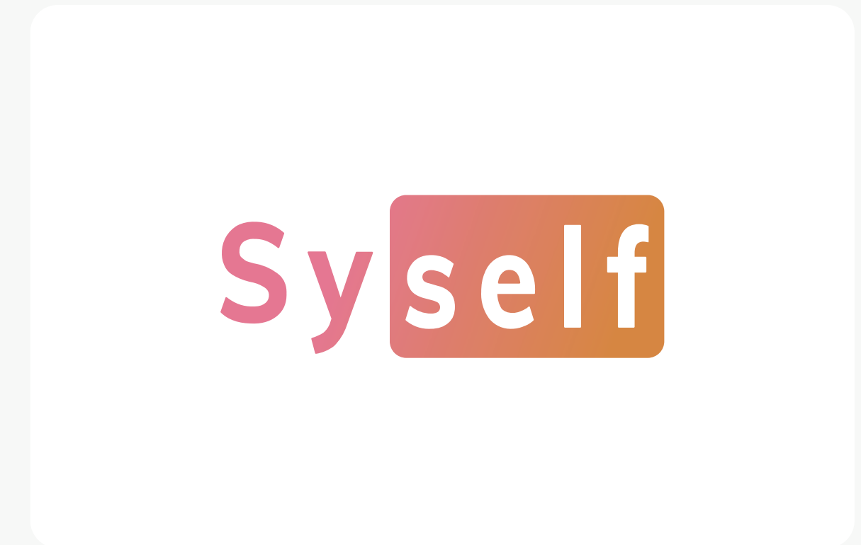
Logo on bright Background