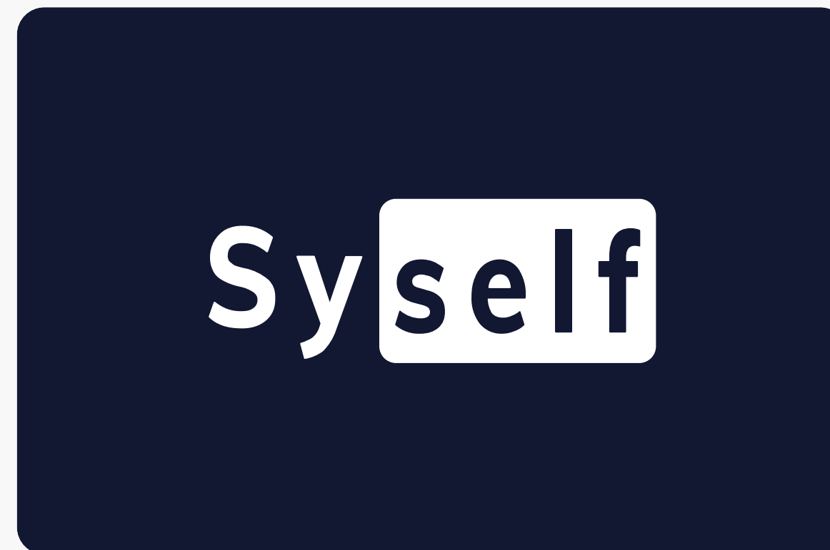
Logo white on Dark Background